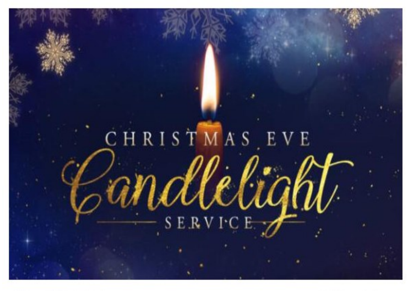
Chapel Hill@ 5pm